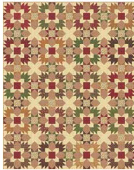
KS 1716 / KS 1716G Fall Flurry Size: 77" x 97"