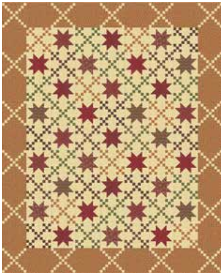
KS 1715 / KS 1715G Autumn Nights Size: 82" x 100"