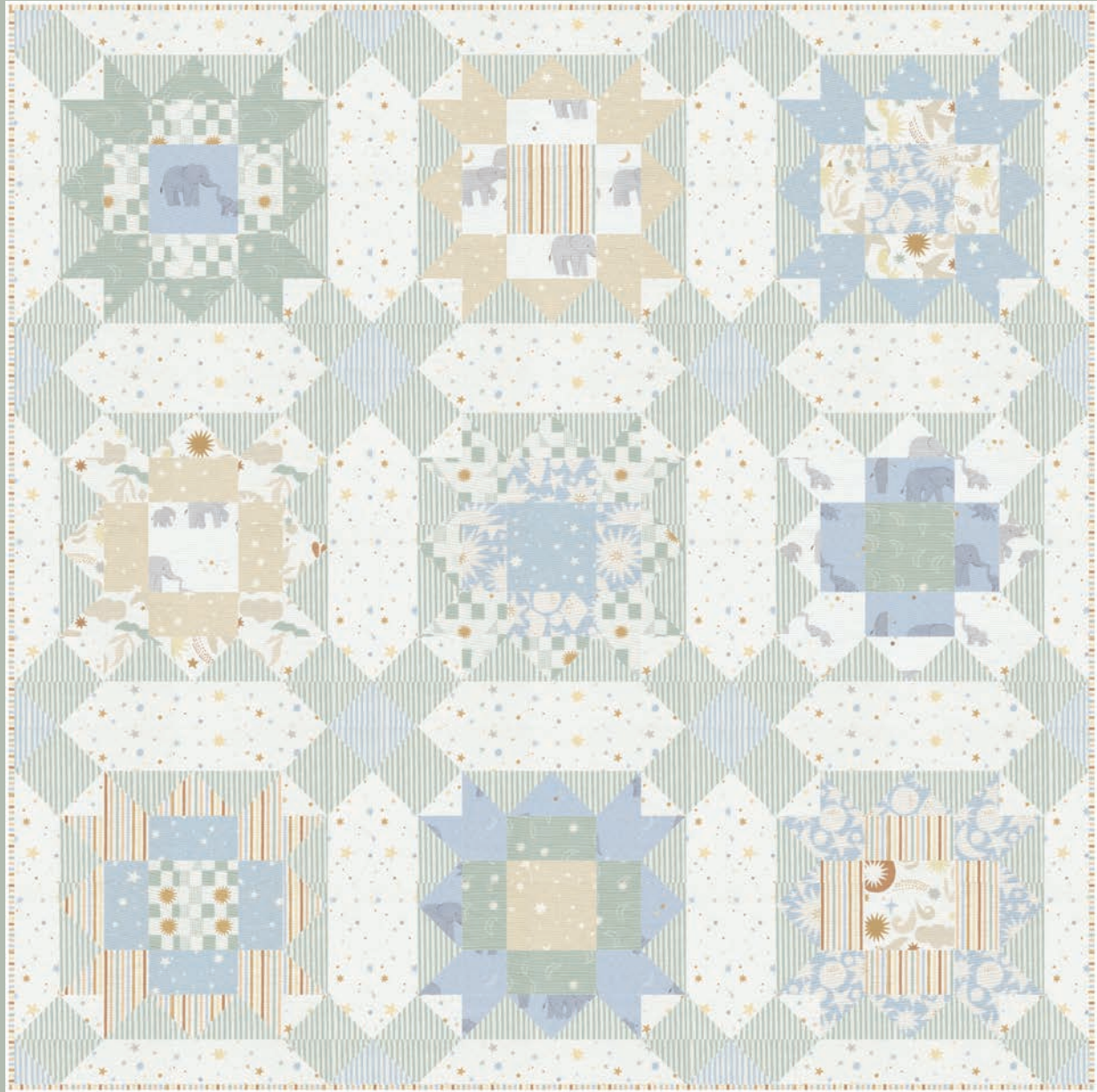
CKQ 2414 Wishy Washi 48" x 48" by Copper Kettle Quilt Company