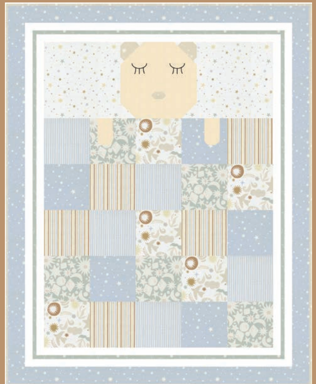
WS 05 Baby Dreams 39" x 49" by Wendy Sheppard